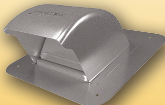
DJK477MR Mill Finish

The DryerJack ® 477 is deep-draw manufactured of Galvalume ® steel and is also available in three powder-coated colors. As the leader in providing a vent termination that meets or exceeds the demanding needs of venting a dryer, the DryerJack is the code compliant choice. The deep draw process delivers a seamless hood providing extra protection against the elements as well as a sleek look for improving home aesthetics.