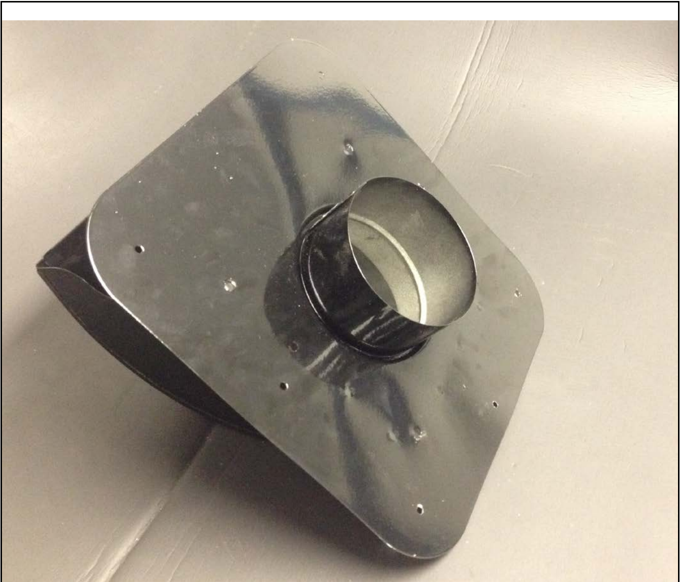
Photograph 4 Before