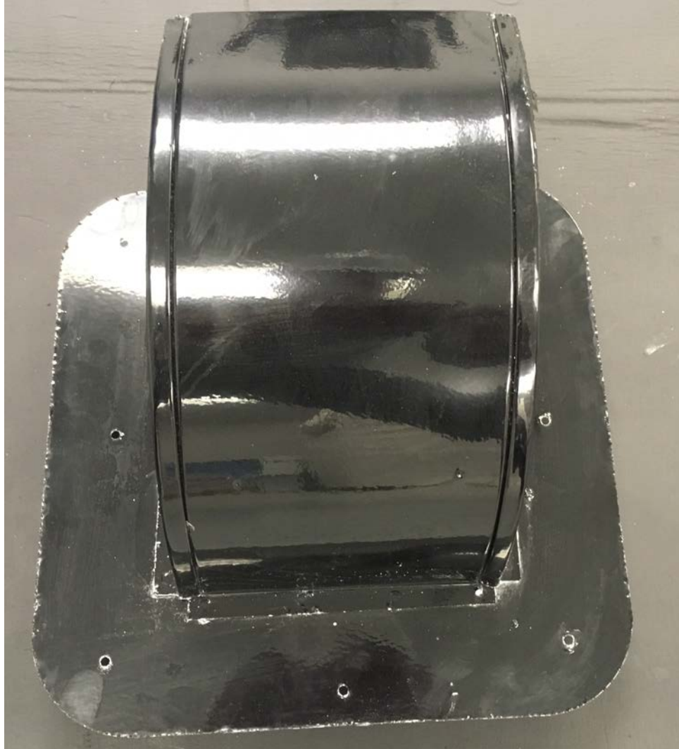
Photograph #9 After