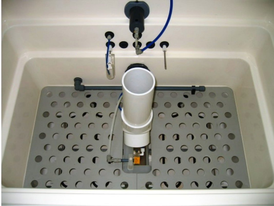
Photograph 6 Cyclic Corrosion Test Chamber