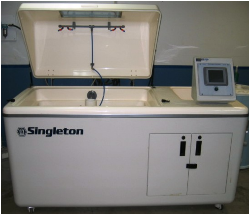
Photograph 5 Cyclic Corrosion Test Chamber