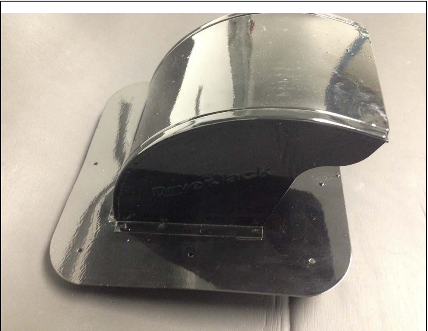
Photograph 2 Before