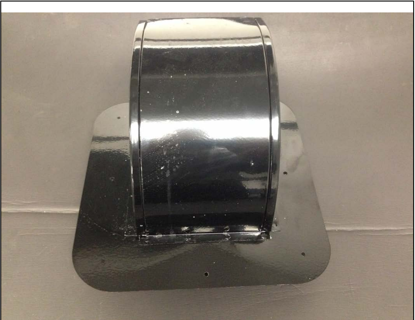
Photograph 3 Before