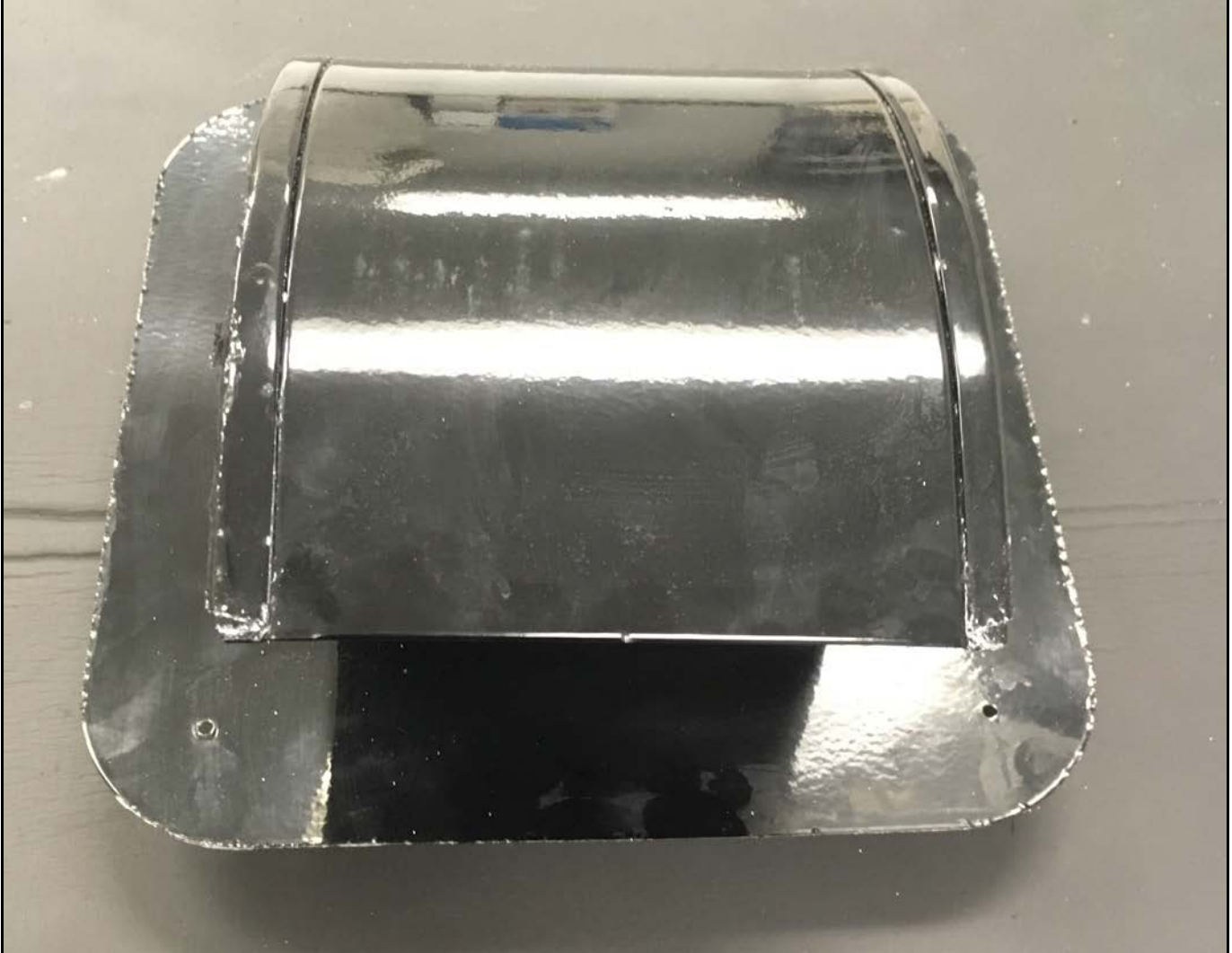
Photograph 7 After