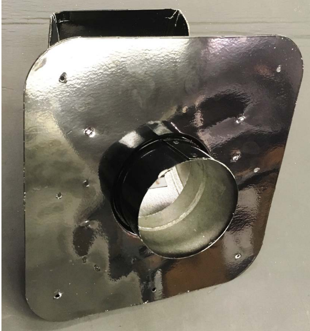
Photograph #10 After