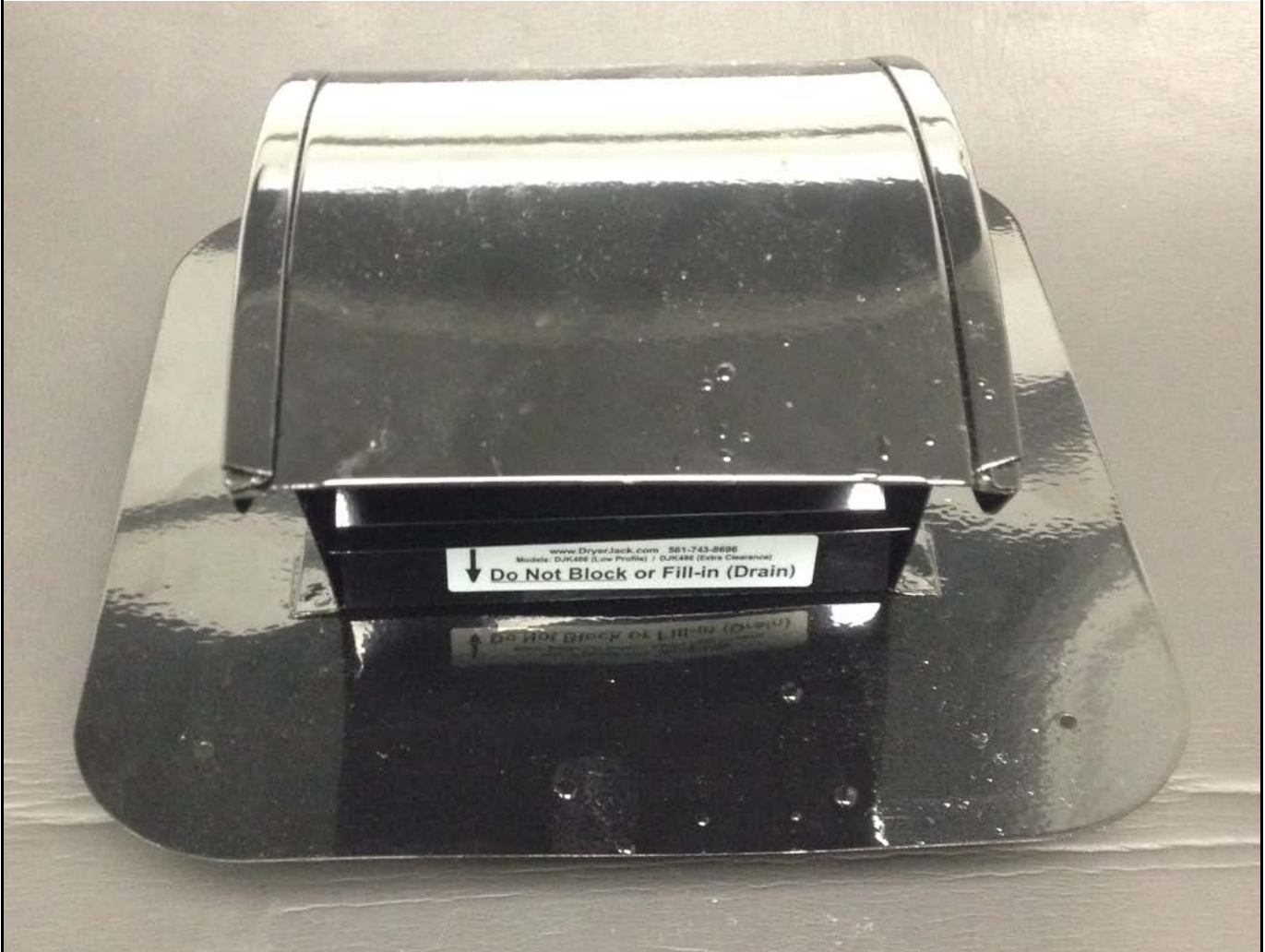
Photograph 1 Before

2.4 Photographs of the untested specimen are shown below.